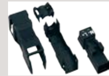
230VAC IP21* Connectors

*Waterproof and non-waterproof connectors depending on your needs, contact us for more information..