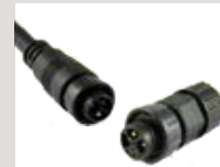
230VAC IP65* Connectors