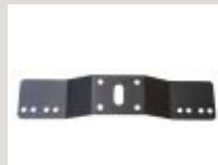
2 tube wall support