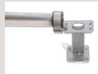
Portable tube support