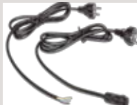
Waterproof / non waterproof connection cables