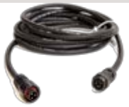
1, 2 and 5 meter cable extensions