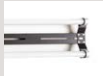
2 tube hanging support